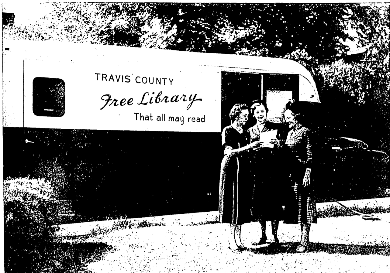
This huge vehicle, light yellow with green lettering, soon will be a familiar part of the surrounding countryside. Travis County's brand new "library on wheels," project of the Austin Branch, American Association of University Women, arrived last week.