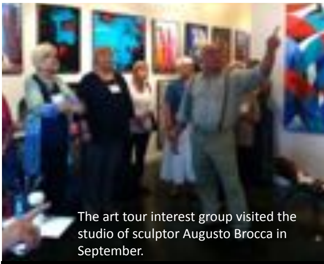
The art tour interest group visited the studio of sculptor Augusto Brocca in September.