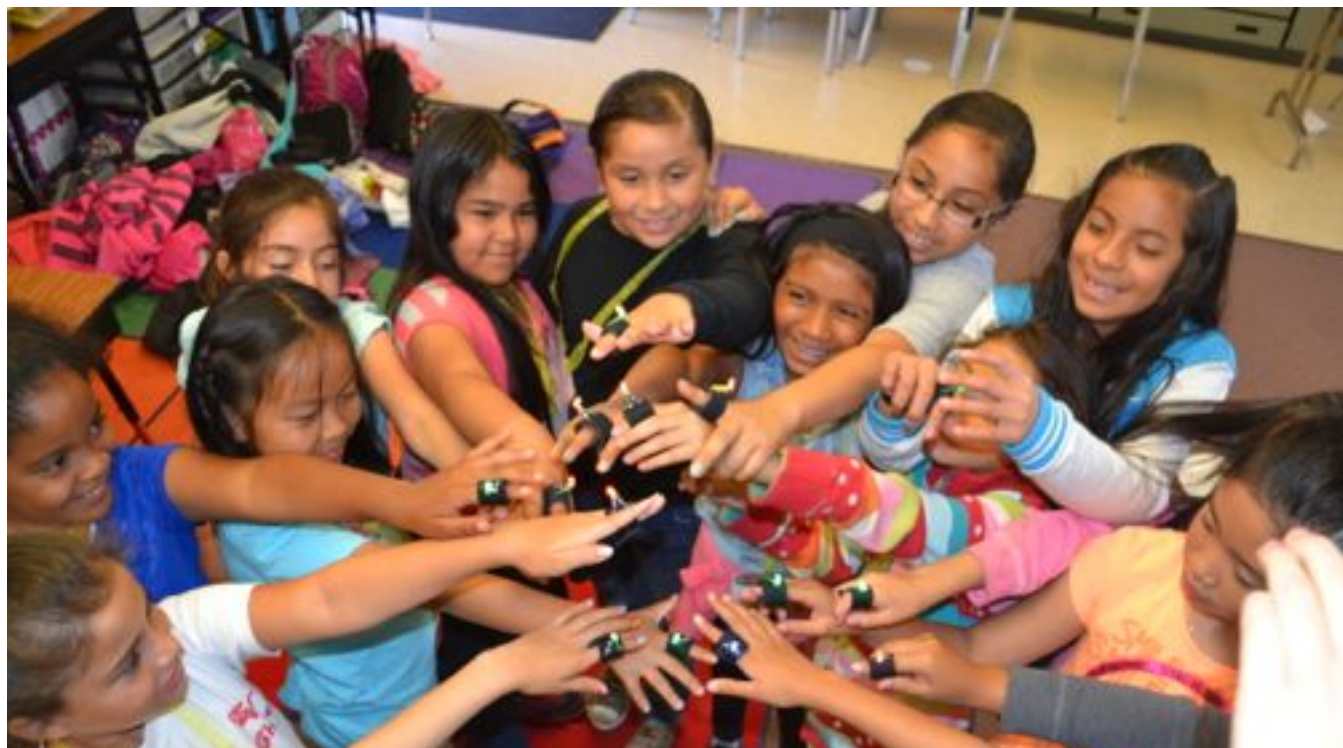
These girls admire the LED rings they made at a Girlstart summer camp.

Ready for another exciting year working with Girlstart and Latinitas, our two STEM projects? You will receive a list of items on your summer social invitation that Girlstart has on its website as a 'need' list for their award-winning After School Program. I hope to see a lot of items there at the social, and I will be glad to carry them over to Girlstart.