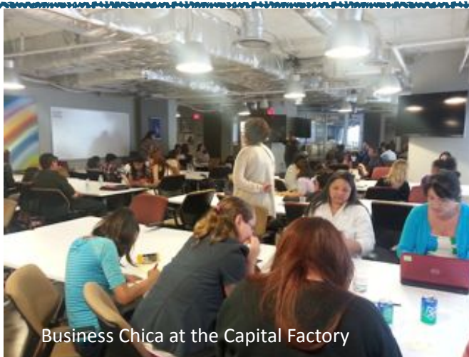
Business Chica at the Capital Factory

Coming up this summer are summer camps at both Girlstart and Latinitas . I have a sign-up sheet for the Latinitas camps for the dates listed below, which can be one morning or afternoon of volunteering as adult chaperone, or presenting a short program (45 minutes) on the topic of the week if it is in an area in which you have expertise.