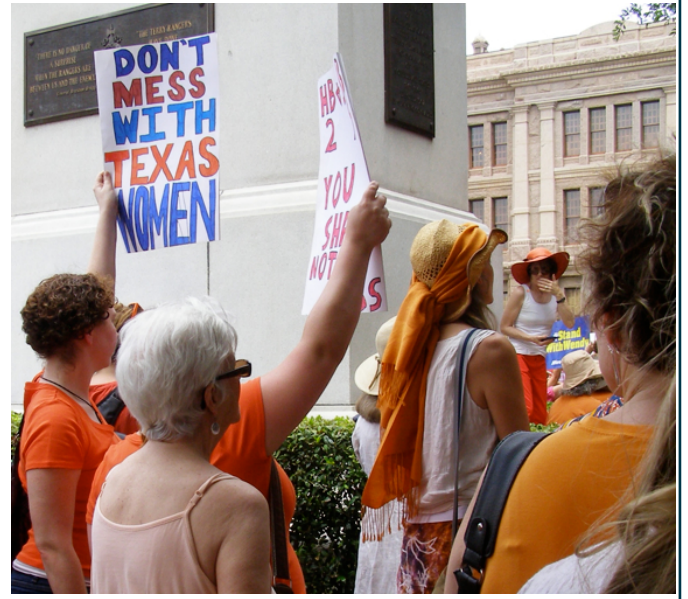
On Sunday, April 27, the closing session (10:45-11:30 a.m.) will provide information on what we must do in the next few months. Speaking on "Beyond Good 'Ole Boys and Ma

The number of women served with contraceptive care, breast exams, pap smears, and screening for health risks, such as diabetes, hypertension, and high cholesterol, has been reduced through clinic closings and cuts in staff and hours. This is more than a women's issue.