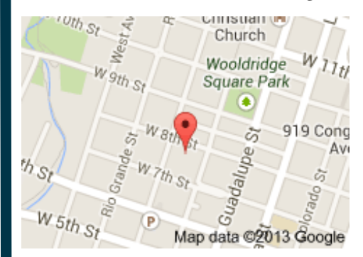
Reminders: RSVP by Friday, November 8 Pay by check or exact cash!

Parking is ample at the Austin Woman's Club. Be mindful that the parking lot is on the back side of the building and is entered from Nueces Street. The entrance to the mansion is from the parking lot level; take the elevator to the first floor which opens into the Chateau Room where we will be meeting.