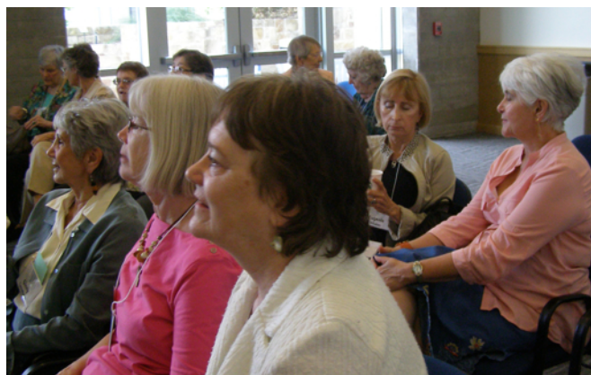
Branch members listen and learn at the April 13 Branch meeting.