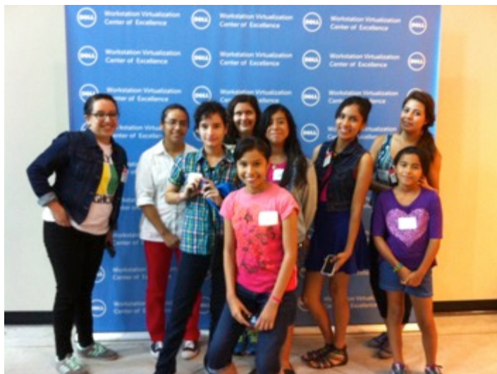
Latinitas summer camp group enjoying tour at Dell Headquarters in Round Rock.