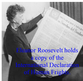
Eleanor Roosevelt holds a copy of the International Declaration of Human Rights.

http://www.un.org/en/events/humanrightsday/2009/