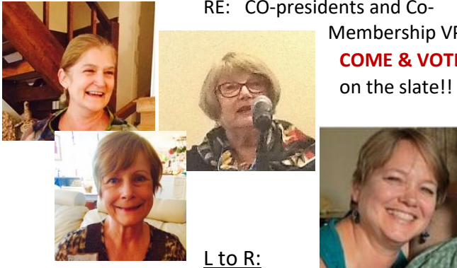
L to R:

RE: CO-presidents and Co-Membership VPs : COME & VOTE on the slate!!