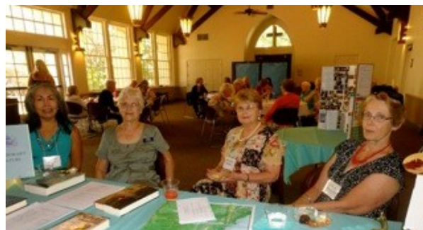
The AAUW (Action, Armchair, Unparalleled, and Wannabe) Travel Study Group explores the world on third Mondays.