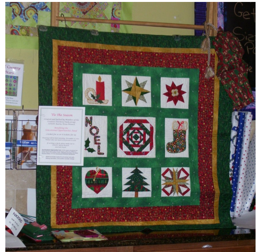
The Cotton Cupboard, 1503 Ranch Road 620 N., Lakeway, helped us promote and raise funds for the Educational Opportunities Fund by displaying our 'Tis the Season Quilt.

http://www.collinstreet.com/pages/online_bakery/shop_by_catalog or order directly via the toll-free telephone number to the Club Department: 800-747-8781. Be sure to use the Austin Branch account number— C012 .