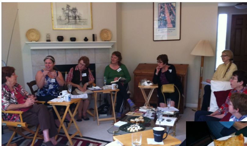
The Books and Brunch Southwest group enjoyed a lively discussion at a recent gathering.