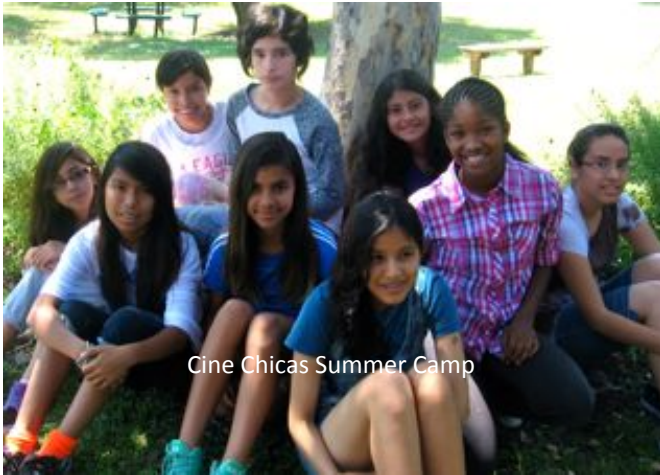
Cine Chicas Summer Camp